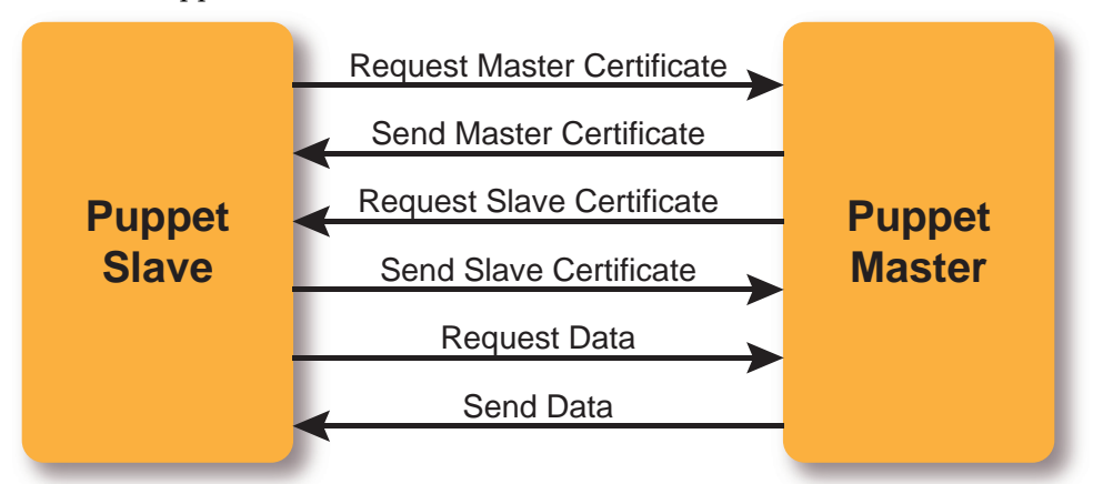
Figure 2. Puppet Master and Slave Communication

In this figure, the following communications are taking place: